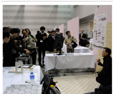
I-DEMO (IDW '14)