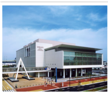
Fukuoka International Congress Center